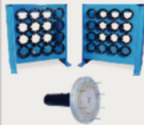
Tool base and Tool rack with QuickChange-tool as an option.